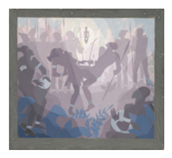
Study for Aspects of Negro Life: The Negro in an African Setting by Aaron Douglas (1934)

some of the most recognizable images of the (era)" (Harlem Renaissance Concept Guide: Art: Enoch Pratt Free Library) Douglas had an original, unique, and modern way of painting his subjects. He used geometric shapes that were often boldly colored to portray his subjects. His style was regarded to have become the most dramatic visual documentation of the movement (Harlem Renaissance Concept Guide: Art:Enoch Pratt Free Library).